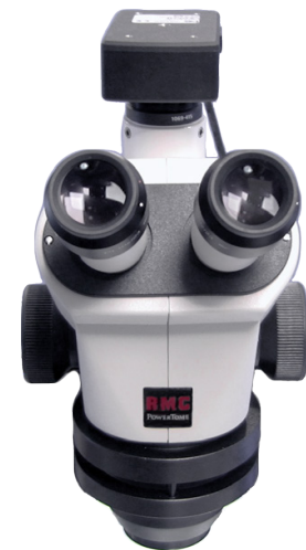
ZEISS 508 TRINOCULAR STEREOMICROSCOPE with 1.3 MEGAPIXEL USB CAMERA