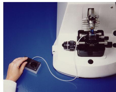
WATER TROUGH FILLER (PERISTALTIC WATER PUMP)