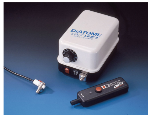
STATIC LINE IONIZER, 110VAC or 220 - 240VAC