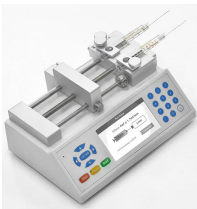
AUTOMATED WATER LEVEL CONTROL SYSTEM (for use with PTPCZ, PT3D, ATUMtome)