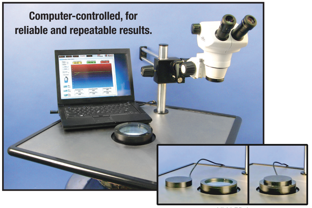
UV LED Lamp

The FS-8500 Freeze Substitution System is designed with safety & operator convenience in mind. With a large volume, easy access, top loading, temperature controlled substitution chamber samples are slowly and gently dehydrated in a solvent solution, following which they are embedded in resin blocks for room temperature sectioning.